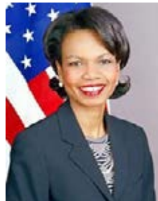
Keynote Speaker: Condoleezza Rice

The WEEC is well-recognized as the most important energy event for end users and energy professionals in all areas of the energy field.